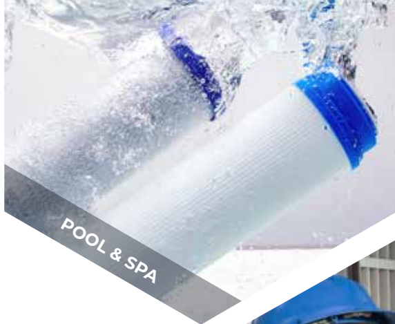
POOL & SPA